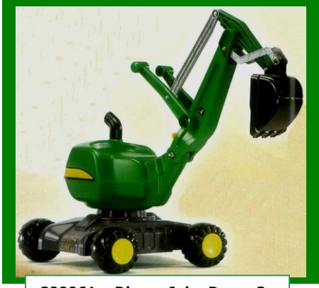
800061 - Digger John Deere 3+