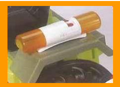
800097 - Light