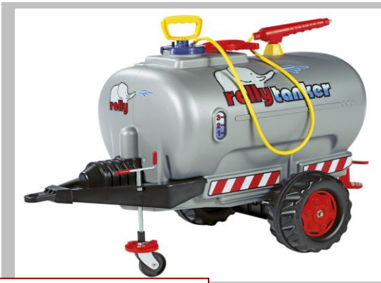
800092 - Tanker/sprayer ♦ with pump and spray nozzle 3+ ♦ avec pompe et arroseur