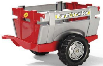
800091-Farm Trailer Red 3+ 800094-Farm Trailer Green