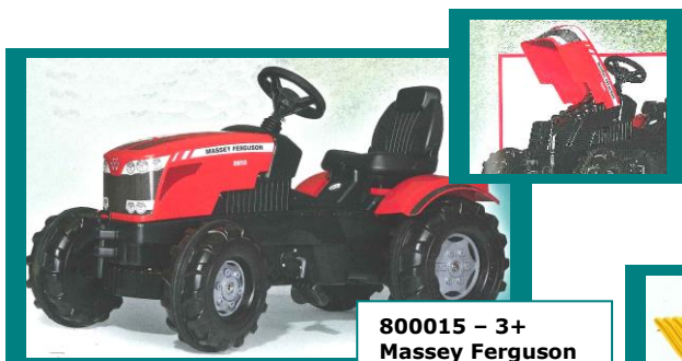
800015 - 3+ Massey Ferguson