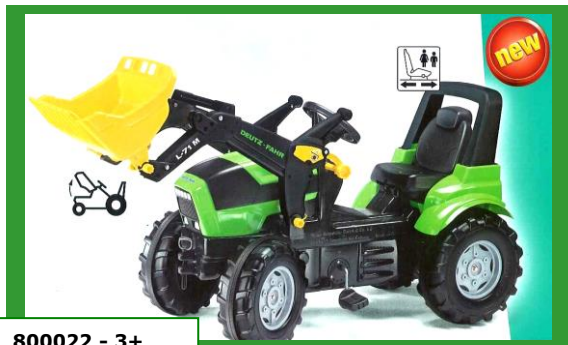
800022 - 3+ Deutz Agrotion