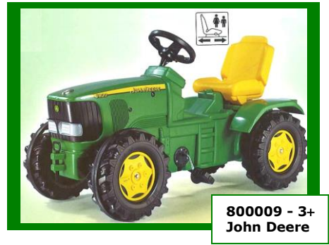
800009 - 3+ John Deere