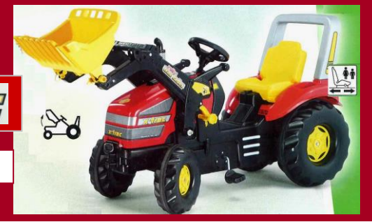
800027 - X Trac 3+