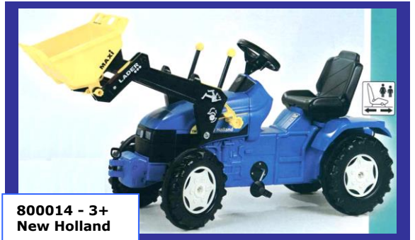
800014 - 3+ New Holland