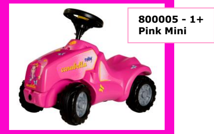
800005 - 1+ Pink Mini