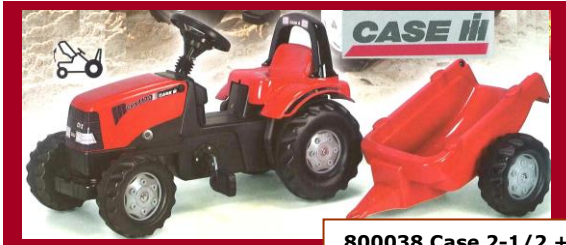
800038 Case 2-1/2 +