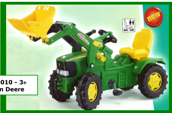
800010 - 3+ John Deere