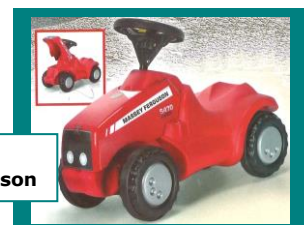
800007-1+ Massey Ferguson