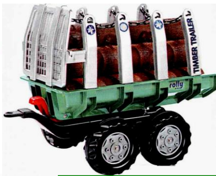
800081 - Timber Trailer 3+ ♦ Twin axle, green, automatic locking ♦ bi-axes, vert, verrouillage automatique