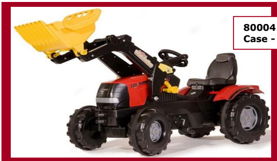
800041 - 3+ Case - Puma