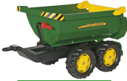
800078 - Dumper - Green ♦ Tripper, twin axle 3+