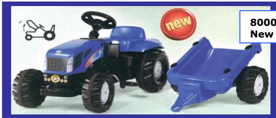
800028 - 2-1/2+ New Holland