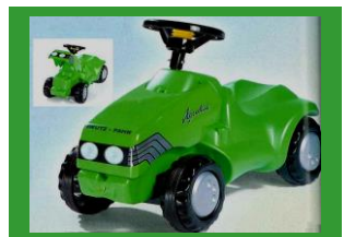
800000 - 1+ Deutz - Aaotron