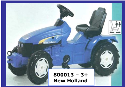
800013 - 3+ New Holland