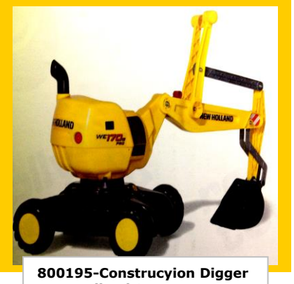
800195-Construction Digger New Holland 3+