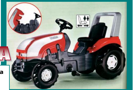
800031 - 3+ Valtra ◆ Hood can open ◆ Capot ouvrant