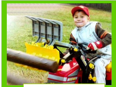
800059-Timber - 3+ Grapple and Bucket