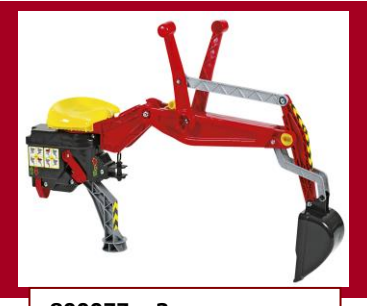
800077 - 3+ Excavator Attachment ♦ with locking mechanism ♦ avec verrouillage, set d' installation