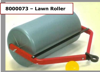
8000073 - Lawn Roller