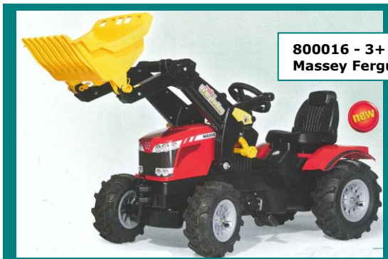
800016 - 3+ Massey Ferguson