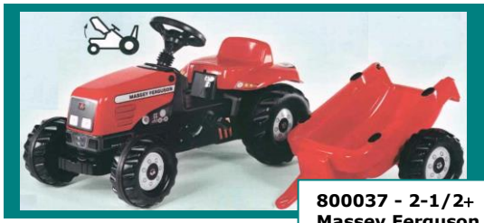
800037 - 2-1/2+ Massey Ferguson