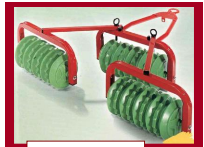
800079 - Roller 3+