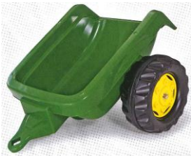
Roly Kid Trailer 800180 Red 800181 Green 800182 Green JD 800183 Blue