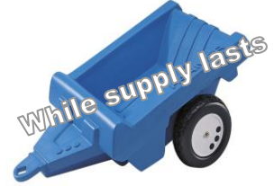
800067 - Trailer Red 800066 - Trailer Blue 2+