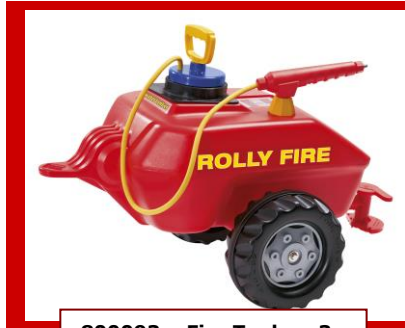
800093 - Fire Tanker 3+ ♦ with pump and spray nozzle ♦ avec pompe et arroseur