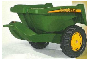
800067 - Trailer JD Green 2+