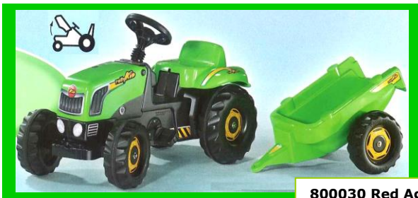
800030 Red Age 2-1/2+ 800029 Green with Horn / avec klaxon intégré