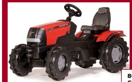
800042 - 3+ Case - Puma