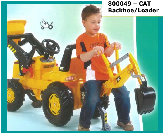
800049 - CAT Backhoe/Loader