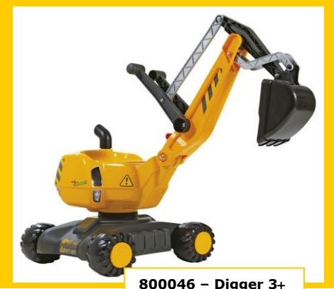
800046 - Digger 3+