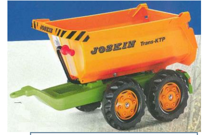
800190 - Dumper - Orange ♦ Tripper, twin axle 3+