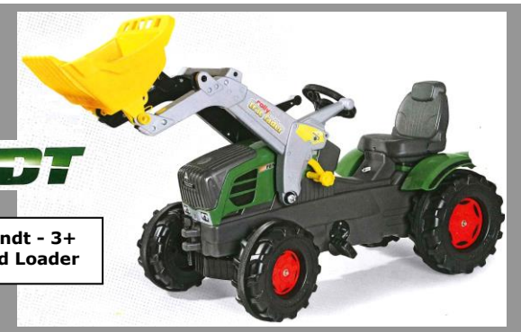
800035 Fendt - 3+ Tractor and Loader