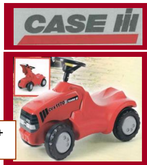
800003 - 1+ Mini Case