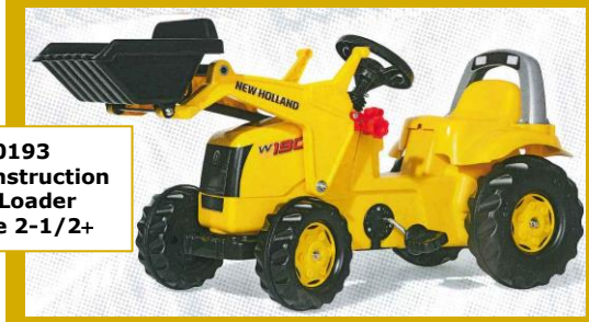
800193 Construction w/Loader Age 2-1/2+