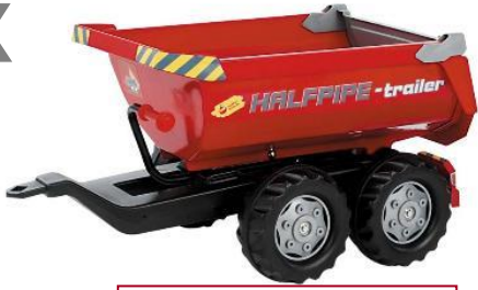
800075 - Dumper - Red ♦ Tripper, twin axle 3+ ♦ remorque basculante, bi-axes