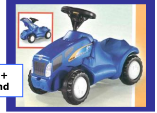
800002 - 1+ New Holland