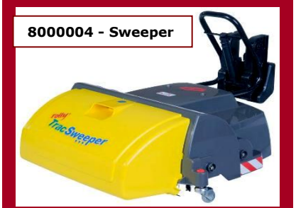
8000004 - Sweeper