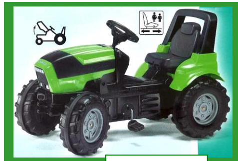
800021 - 3+ Deutz Agrotion